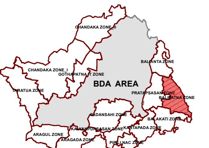
KEY MAP: ZONE IN EXTENDED AREA