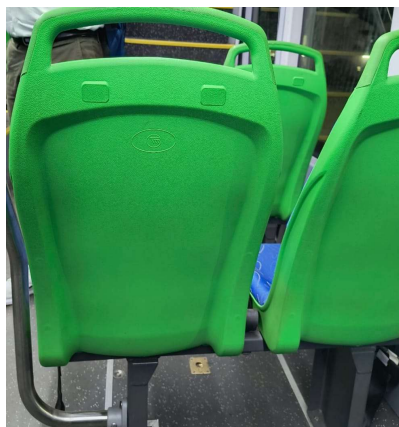
Seat Back Space