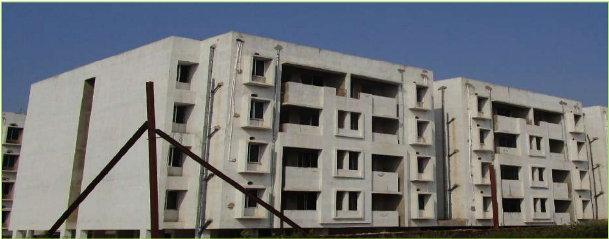
1 BHK BLOCK